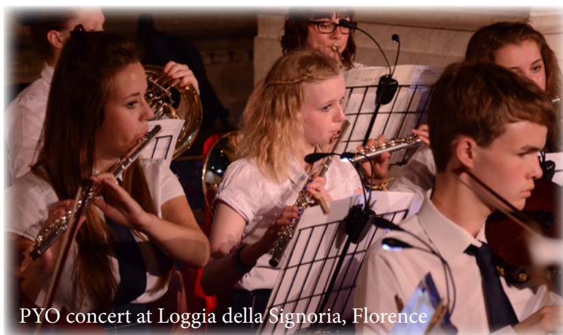
PYO concert at Loggia della Signoria, Florence

From 30th November, new tour members will find that the cost of the tour has increased by £50 due to the higher price of their airfare.