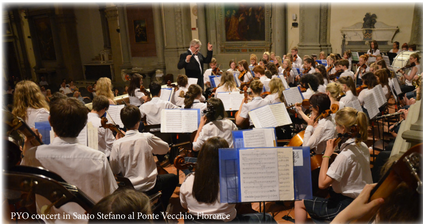
PYO concert in Santo Stefano al Ponte Vecchio, Florence

your instrument until you are able to collect it.