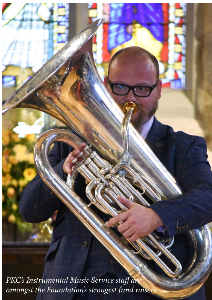
PKC’s Instrumental Music Service staff are amongst the Foundation’s strongest fund raisers.

PKMF’s efforts are brought into sharper focus since Perth and Kinross Council decided that from August 2018, they would increase Instrumental Music Tuition and Central Group fees by 20% with further considerable increases also approved for 2019/20 and 2020/21.