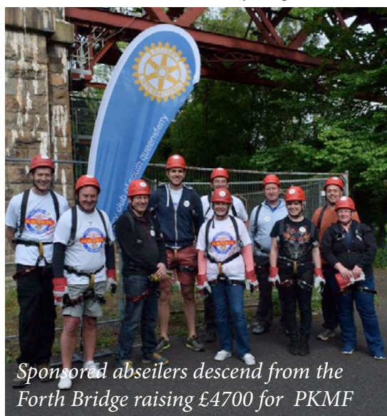
Sponsored abseilers descend from the Forth Bridge raising £4700 for PKMF

"PKMF's efforts are brought into sharper focus since Perth and Kinross Council has decided that from August 2018, they would increase Instrumental Music Tuition and Central Group fees by 20% (with further considerable increases also approved for 2019/20 and 2020/21). The fees for