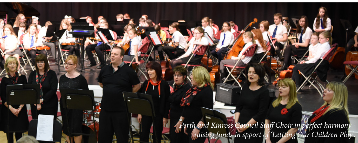
Perth and Kinross Council Staff Choir in perfect harmony - raising funds in support of ‘Letting Our Children Play’.

to the next academic year, given the fee increases noted above, it is easy to see that we will need to do more over the coming months to raise funds/secure grant funding.