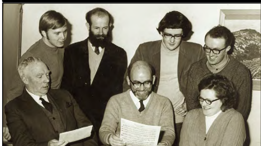
In the early days of the Instrumental Music Service - a great leader