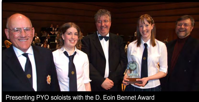
Presenting PYO soloists with the D. Eoin Bennet Award