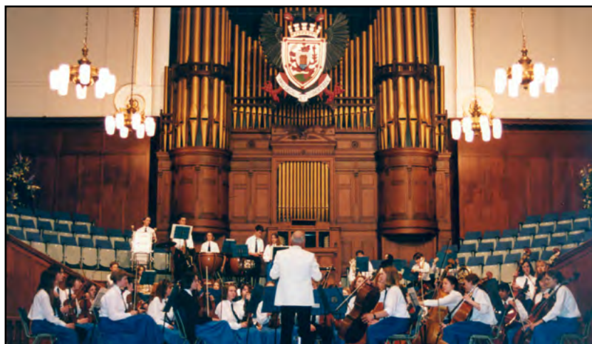
PYO Annual Concert in Perth City Hall - inspiring a new generation

"What an inspirational man and wonderful personality! Great memories I'll always treasure."