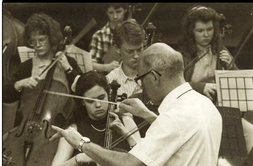
Conducting Perth Youth Orchestra - in tune with young talent